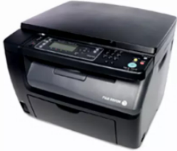
A4 clear color laser porcelain image printer, has been refitted, with scanning and copying1200*2400dpi