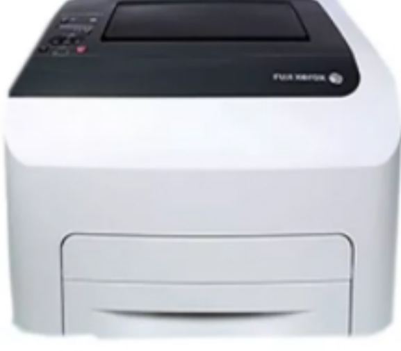
High-quality A4 high-definition color laser ceramic image printer, has been refitted, 1200*2400dpi