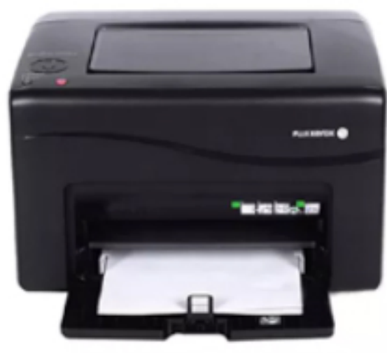
Entry-level A4 color laser porcelain image printer, refitted, 1200*2400dpi