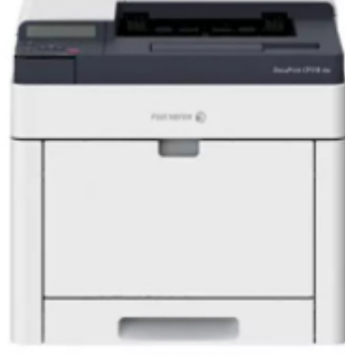
Advanced A4 color laser ceramic image printer, refitted, 1200*2400dpi